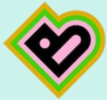
Bradford City of Culture